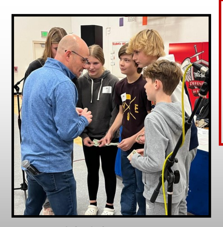
8th Grade Courage Retreat